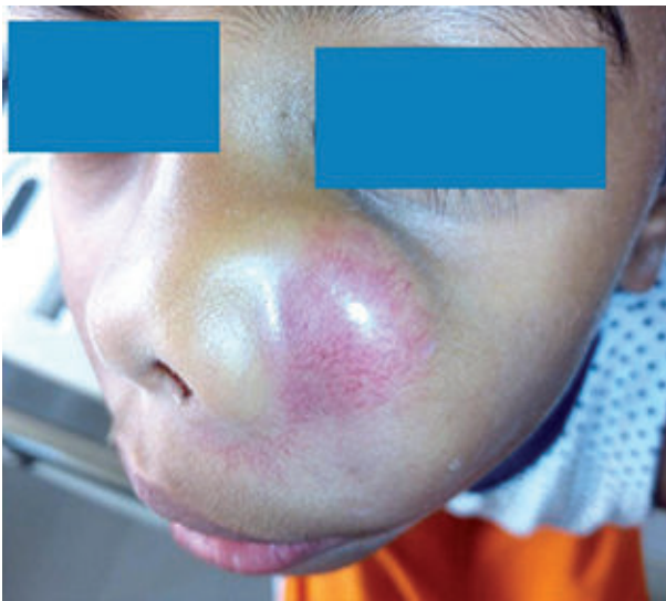
Figure 4: Extra-oral clinical photograph of a Ewing's sarcoma patient showing diffuse swelling on left maxilla.

All had swelling, pain, ulceration, and loose teeth; 40% had paresthesia, nasal bleeding, toothache, and limitation of mouth opening. Among the two patients with Ewing's sarcoma (Fig-4),