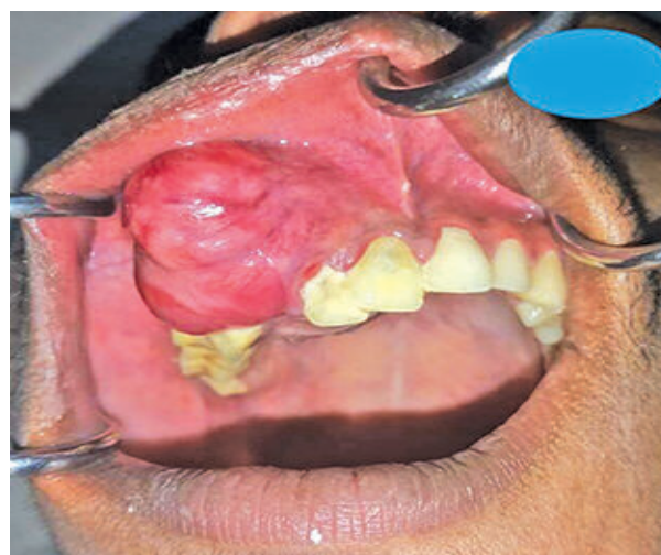
Figure 2: Intraoral image showing the right maxillary swelling of a fibrosarcoma patient