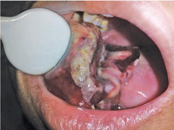
Figure 3: Intraoral image of a ulcerated swelling on posterior aspect of mandible of a rhabdomyosarcoma patient

All had swelling and toothache, and 83.3% had pain. Among five rhabdomyosarcoma patients (Fig-3),